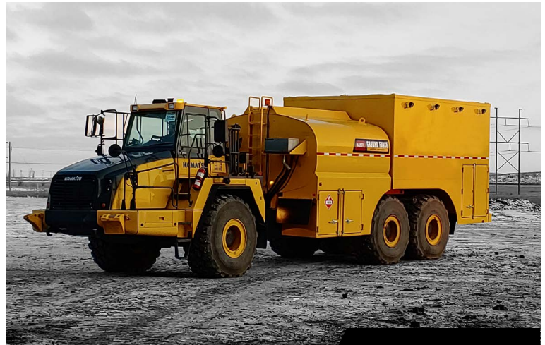
Heated & Enclosed for Extreme Conditions

We offer many configurations and custom features, as well as heated and enclosed fuel and lube trucks for extreme and cold weather applications. Designed with a low center of gravity and safety features such as roll-over protection, the Ground Force Articulated Fuel and Lube Trucks are PROVEN in the most extreme terrain. Ground Force Worldwide is the WORLD LEADER in Articulated Fuel and Lube Trucks, with 200+ trucks in mines across the world today.