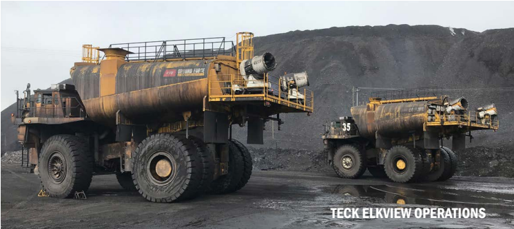
TECK ELKVIEW OPERATIONS