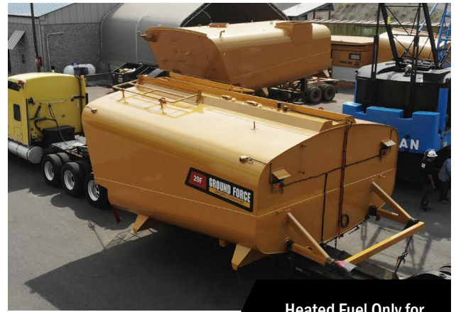
Heated Fuel Only for Extreme Conditions