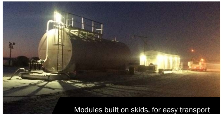
Modules built on skids, for easy transport by lowboy or towing with track-type tractor.