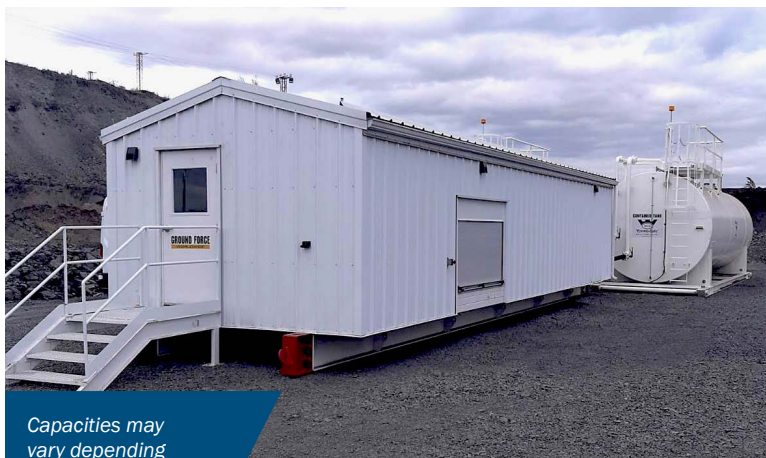
Capacities may vary depending on custom requirements.