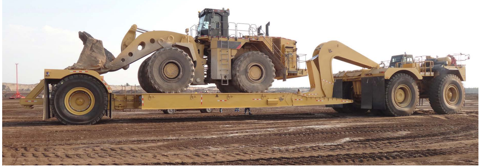
All dimensions, specifications, and product availability are subject to change based on continual product improvement and customer request.