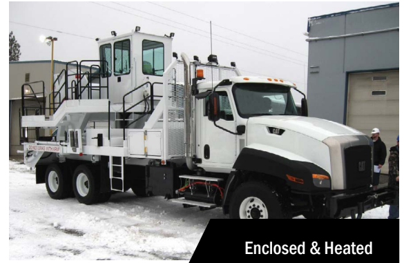
Enclosed & Heated Operator Station